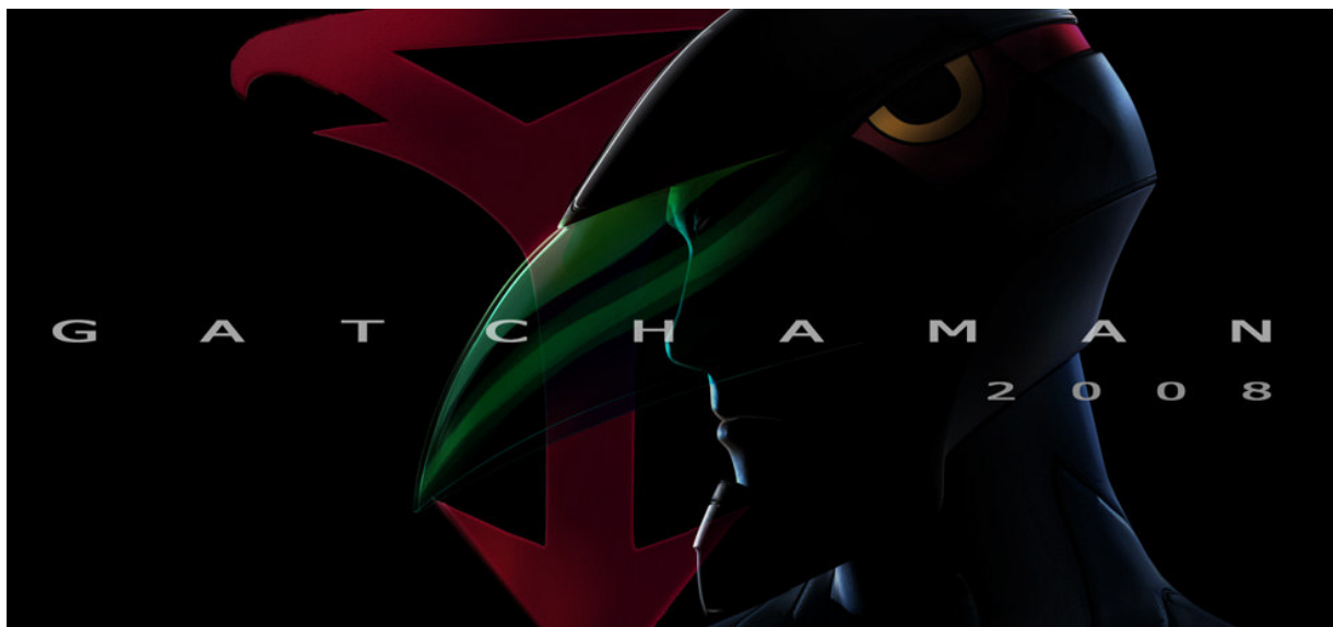
Conceptual CG Illustration

Munroe expresses his excitement about this new project with Imagi, "Growing up as a kid, "Gatchaman" was the first influence that pushed me into the world of animation, comics and writing. I'm absolutely thrilled to get the chance to bring the high-flying adventures of Gatchaman to the big screen the way they were always meant to be - huge action mixed with the real human drama that arises when five teenagers must become the heroes of an entire planet. "Gatchaman" is a great next step after "TMNT", not only personally in terms of storytelling and visual scope, but also for Imagi as a production company. This film is going to push the envelope of Imagi's already-impressive capabilities, and continue blazing the CG path that will be started by "TMNT"'s release in 2007. Gatchaman is going to be huge, and I couldn't be happier to be a part of it. It's literally a childhood dream come true."